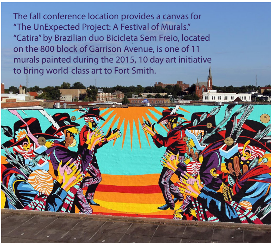
The fall conference location provides a canvas for “The UnExpected Project: A Festival of Murals.” “Catira” by Brazilian duo Bicicleta Sem Freio, located on the 800 block of Garrison Avenue, is one of 11 murals painted during the 2015, 10 day art initiative to bring world-class art to Fort Smith.